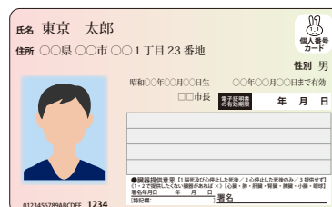
Japan Individual Number